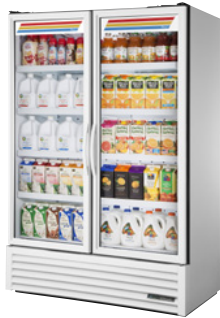
Optional White Exterior