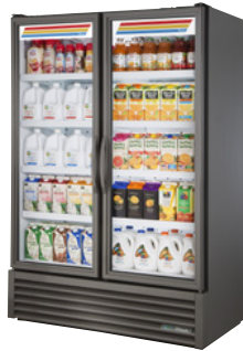
Optional Gray Exterior